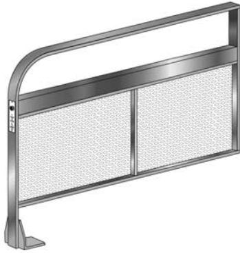
CE-810-655-E PUSH BUTTON GUIDE RAIL WITH EXPANDED ALUMINUM PANEL*