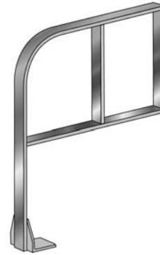
CE-806* GUIDE RAIL FOR BI-FOLD DOOR