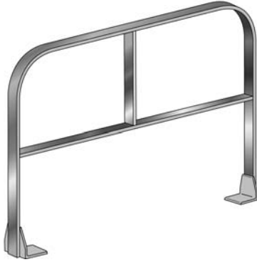
CE-803 DOUBLE CURVE GUIDE RAIL